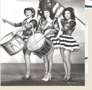
July 4<sup>th</sup> Independence Day

Ventura Townehouse 4900 Telegraph Road Ventura, CA 93003 Phone: 805-642-3263 Fax: 805-642-3229 Venturatownehouse.com